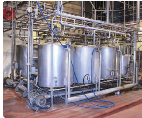
(3) 4-Tank CIP Systems, Fully Outfitted

Other Additional Cow Water Equipment Including: Alfa Laval Plate Press, Model M10-BFG, Evapco S/S Condenser and Other Auxiliary Equipment