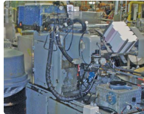
Large Selection of Butter Packaging Equipment