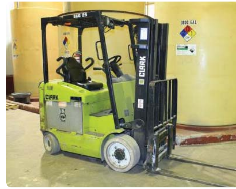
(4) Clark and Caterpillar Forklifts