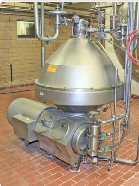
(3) Alfa Laval and Westfalia Separators, (2) Gaulin and APV Homogenizers, (2) APV HTST Type R51T Systems with Presses, (4) Processors, (50) S/S Tanks and Crystallizers, (7) Screw RXF Compressors, (2) Evaporators, Butter Equipment, and MORE, MORE, MORE!!!