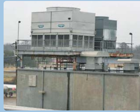
Evapco S/S Evaporative Condensers