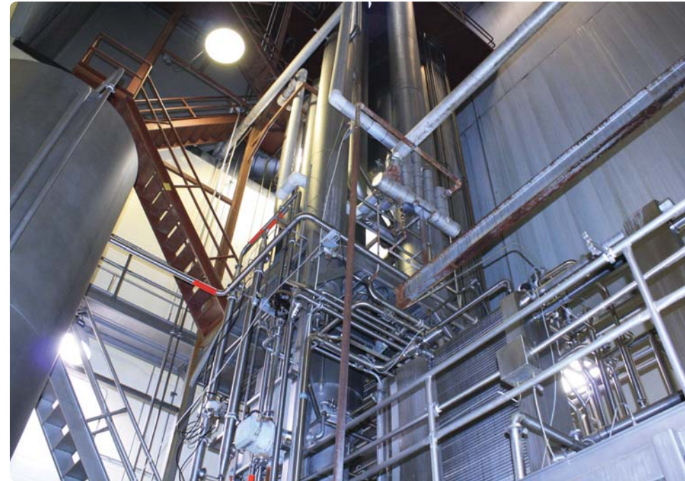
Niro 5-Effect Evaporator, Fully Equipped, Well Maintained with Recent Upgrades!!! (1 of 2) Being Offered

Dairy Farmers of America • Sulphur Springs, Texas