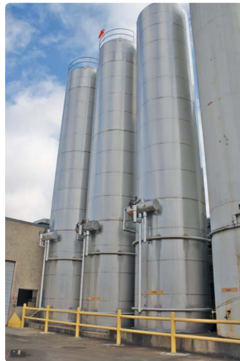
(4) 2004 to 2001 Mueller 50,000 Gallon S/S Silos