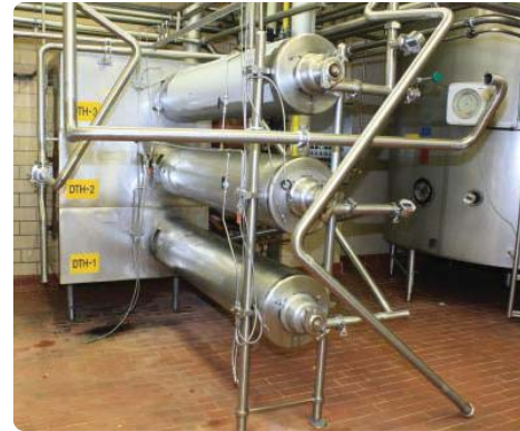
Cherry Burrell 3-Barrel Thermutator