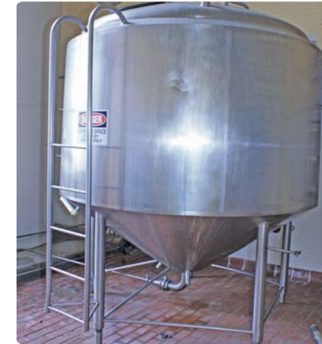
Crepaco Approximately 1,000 Gallon Dome-Top Cone Bottom S/S Processor