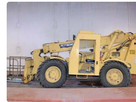
Pettibone 8,000 lb. Capacity Extendo Lift