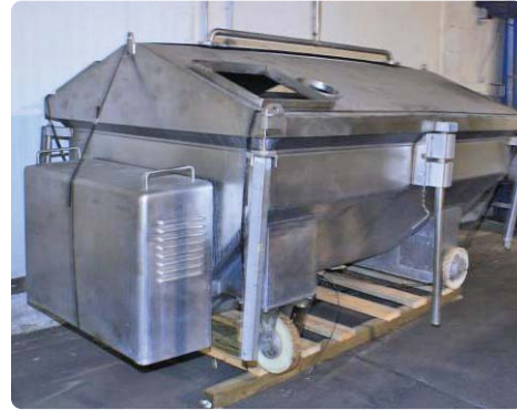
Eglin S/S Butter Boat