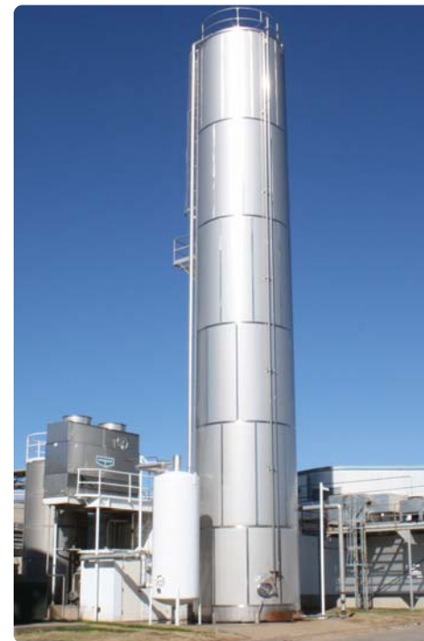
2003 Walker 70,000 Gallon S/S Silo