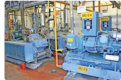
(2) Complete Ammonia Compressor Systems

DAIRY FARMERS OF AMERICA THURSDAY, APRIL 8, 2010 AT 9:30 A.M. Featuring Over (40) Stainless Tanks, (2) Evaporators, (4) Crystallizers, (4) Processors, (3) Separators, (2) Homogenizers, (5) HTST Systems and Plate Presses, (4) CIP Systems, (2) Refrigeration Systems, Cow Water System, Butter Equipment, Air Handling, Material Handling, Motor Control Centers, Truck Scale, Boilers, General Plant, Lab Equipment, Maintenance, Rolling Stock, Office Equipment, Spare Parts, And MUCH, MUCH, MORE!