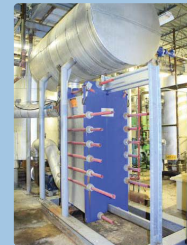
2002 Glycol System

Morpac/Lynch Wrapper, Type R0HS, S/N 941020 with Nordson Gluer