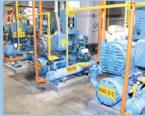
Frick Screw Ammonia Compressors