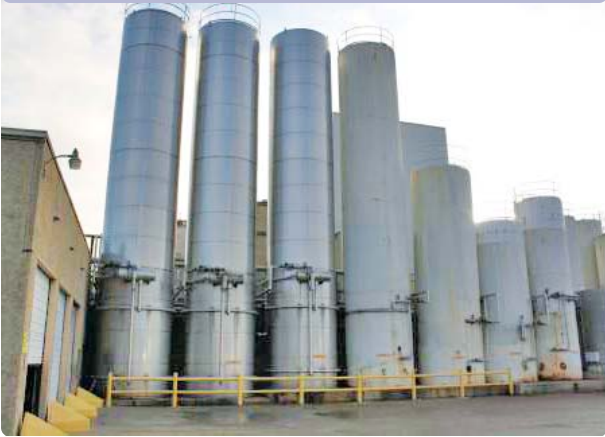
Over (60) Stainless Tanks, Silos, and Processors

Sulphur Springs, Texas Thursday, April 8 at 9:30 a.m.