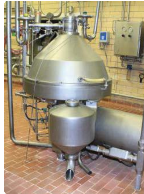
Alfa Laval HMRPX618 CIP Separator