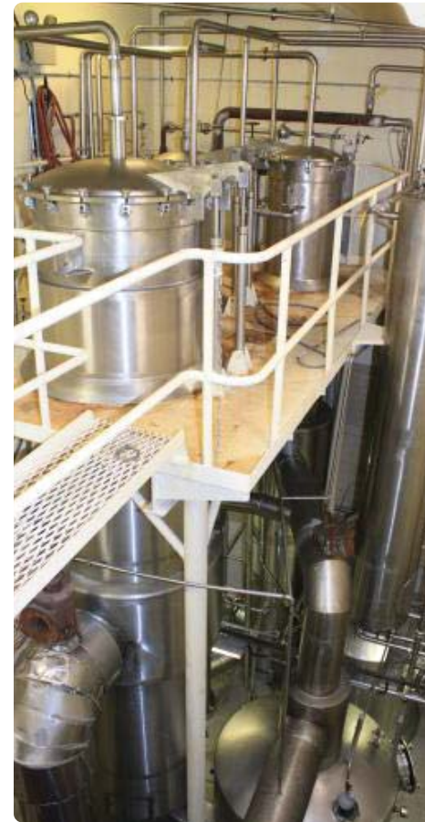
Blawnox 3-Effect Evaporator – Easy Removal!