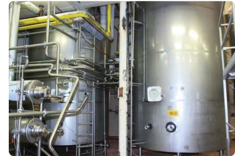
(4) DCI 6,000 Gallon S/S Crystallizers