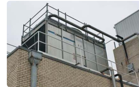
2000 Marley Cooling Tower

Large Assortment Spare Parts Inventory for Most Machinery and Equipment Including Separator Parts; Homogenizer Parts; Tank Parts; Electrical Supplies; Various Hardware Bins with S/S and Other Bolt Hardware; V-Belts; Plumbing Supplies including Some Stainless; Assorted S/S and Other Stock Inventory including: Flat Stock, Square Stock and Other with Tubing; Assortment New Motors; Blowers; Pumps; New Federal Pacific 30 KVA Transformer- Primary 480 V, Secondary 240/120 V, LT 3 Phase, & More