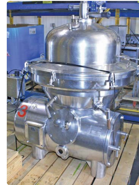
(2) Westfalia CIP Separators, Type SAMM12006