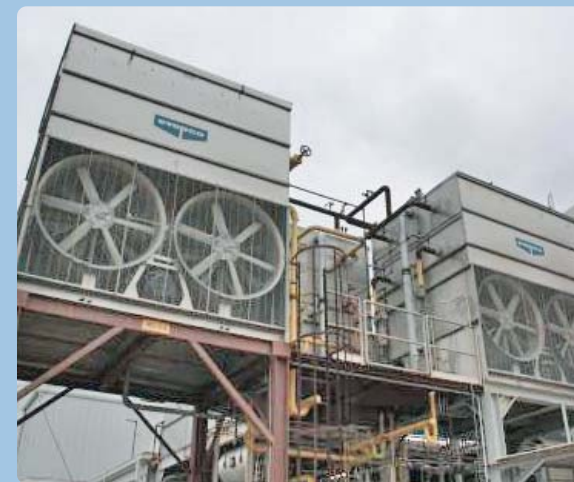
Evapco S/S Evaporative Condensers