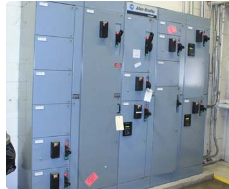
(7) Allen Bradley & Square D Motor Control Centers