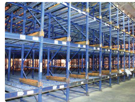
Over (100) Sections of Deep Pallet Racking