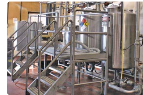
Fully Outfitted 3-Tank CIP System

Chester Jensen 200 Gal. S/S Dome-Top Processor, Type A-G, S/N SCD-123-DS