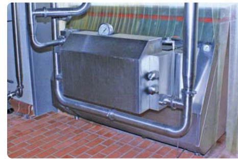
APV Homogenizer, Model G132Q