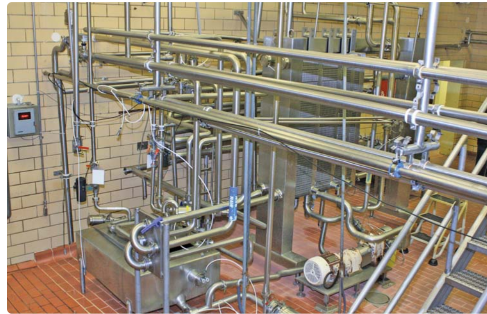
APV HTST System with Press, Type R51T, Complete with (3) Dividers, (120) Plates, Fully Outfitted

Regulators; Ridgid Sewer Cleaner; Portable Milwaukee Core Drill; Anvil; Ridgid 535 Pipe Threader with Dies; Greenlee Portable Condulet Bender; Graco Pneumatic Pumps; Overhead 1-Ton Electric Hoist System with Trolley and I-Beam; Ridgid Tri-Stand Pipe Vise; (20) 2-Door Steel Tool Cabinets; Confined Space Safety Equipment; 6-Station Lube Center; Various Hand Tools; Flammable Cabinets; Barrel Dollies; Various Ladders; Hydraulic Pallet Jacks; Greenlee Pipe Bender; Dayton 2-Ton Portable Crane