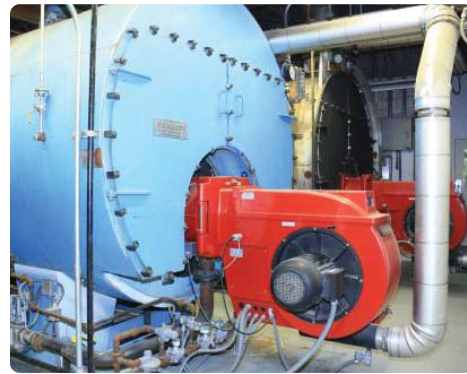
Kewanee and Cleaver Brooks 750 hp Boilers