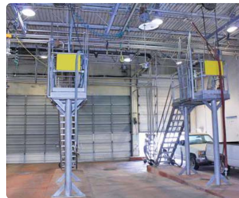
Fully Outfitted 2-Bay Tanker Receiving System