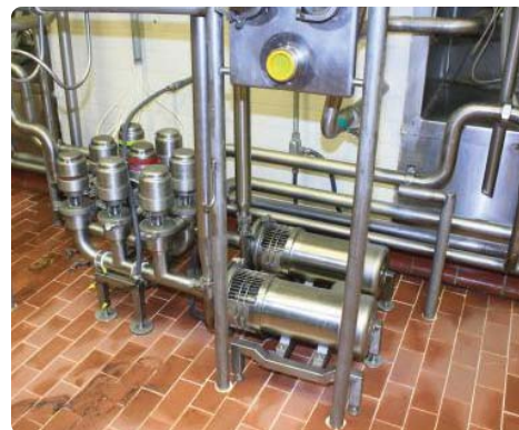
Large Selection of Pumps and Air Valves—Fristam, Tri-Clover and Others!