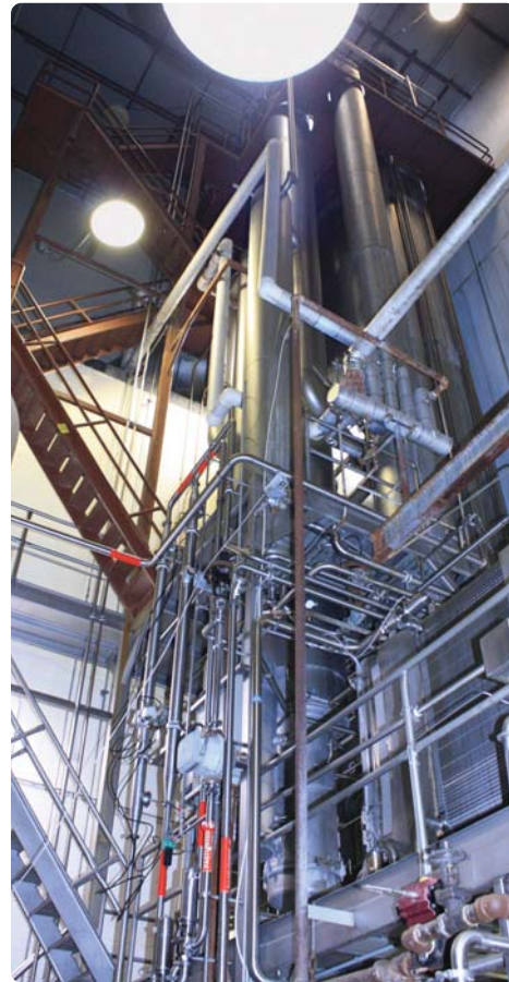
Niro 5-Effect Evaporator – Easy Removal!

Approx. 300 Gal. Hinged Lid Jacketed S/S Tank with Agitator