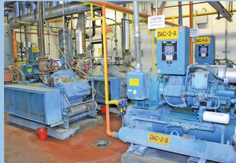
Frick and Mycom Ammonia Compressors