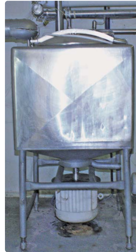
Breddo 200 Gallon S/S Liquifier